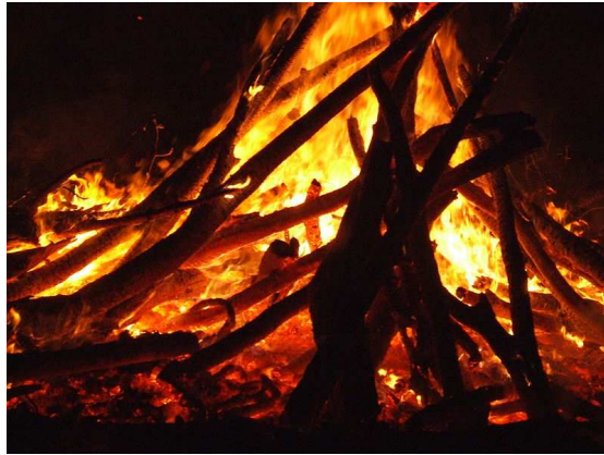
Our bonfire - only a fantasy!