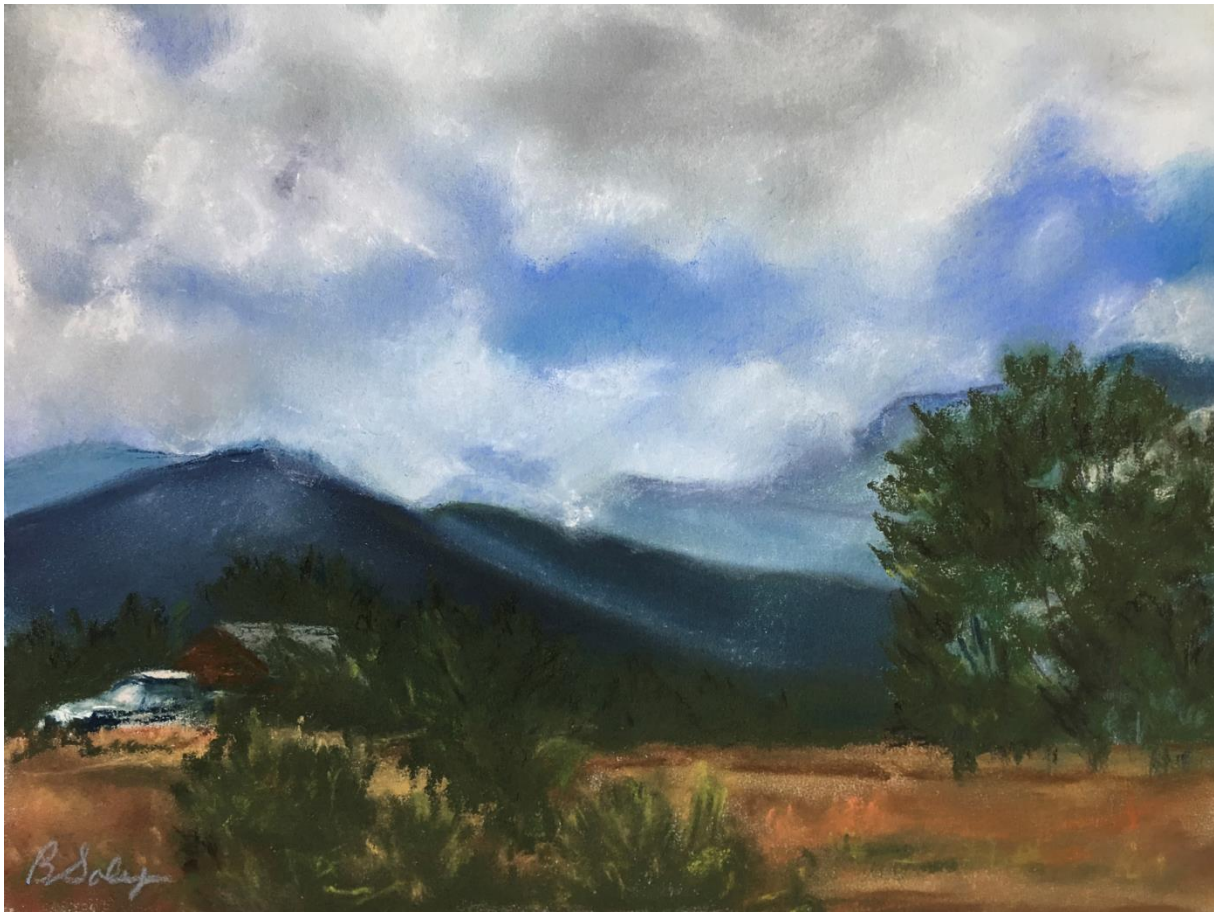
Pastel, Off the Beaten Track